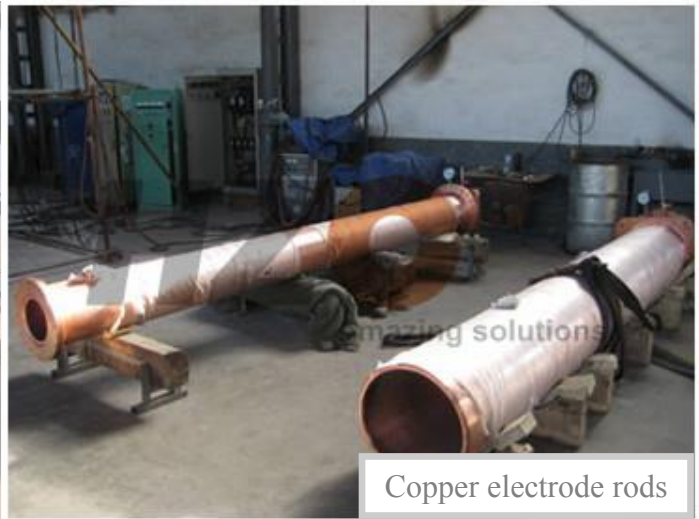
Copper electrode rods