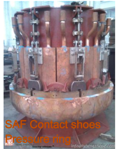
SAF Contact shoes Pressure ring