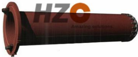
Crystallizer & crucible