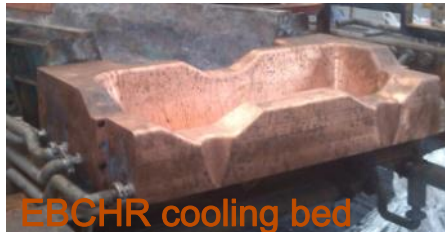
EBCHR cooling bed

Raw Materials | Machining Factory | Professional Design Team | Strict Quality Control | Experience in project contracting